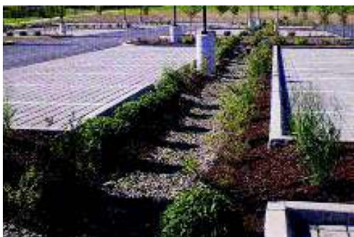
Bioswale in parking lot

Another good choice is a bioswale. To accommodate runoff from larger storms, a bioswale in the center of this parking lot (left) acts as a backup system to the pavers, drawing excess water and allowing filtration. Mark Hadley of an Oregon architecture and engineering firm says, “the parking lot is permeable on a one-to-one ratio. Every square foot of permeable pavement reduces pollutants by the same square footage. By reducing the quantity of runoff as well as by infiltrating that water, we’ve also minimized the water-quality detriment going into the stream.”