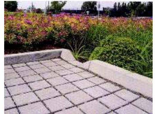
Parking lot in Oregon

A system used in Minnesota and Oregon is the Environmental Passive Integrated Chamber (EPIC) system. “The EPIC system is a non-clogging drainage and subsurface irrigation technology that utilizes passive, natural processes of water movement to manage and direct water resources. It reduces water pollution, decreases irrigation water use by 50% to 80%, and manages massive stormwater volumes using living systems of green space to treat and reuse water,” says Mark Apfelbacher of Rehbein Environmental Solutions, Inc. The EPIC system, constructed of recycled polypropylene, is composed of a liner pan, the injection-molded chamber, and sand fill that covers and surrounds these. Storm water surge or runoff is retained in the system for reuse or slowly released in a controlled manner.