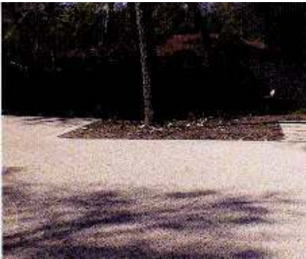
Site of Heroes Gym in Dallas

Permeable pavement is becoming a best management practice of choice for many seeking to address water-quality concerns. Not only is permeable pavement doing its job with regard to water quality and quantity, but it also is adding aesthetic value to property. Many places throughout the country are using various means to address storm water concerns.